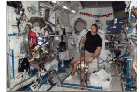
Astronaut Mike Hopkins in Space

For Catholic astronauts, flying to space doesn’t mean giving up the faith. On the International Space Station (a habitable artificial satellite, in low Earth orbit) there’s a place called the Cupola, where astronauts like to hang out. It’s a small module with seven large bay windows that give crew members a panoramic view of Earth.