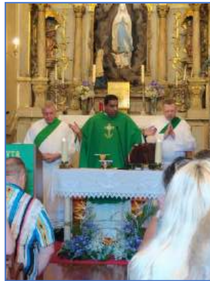
Last Sunday’s Mass

Reflecting on that experience reminds me of today’s readings and how they speak about the strong bond between Christ and His Church. Just like the natural connection I felt with my cousins because of our shared family ties, there’s a deep, unbreakable bond between Christ and His Church, because we are His Body - His flesh and blood - joined to Him through our faith and the sacraments.